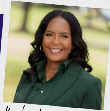
Keisha Lance Bottoms